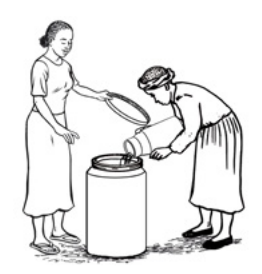
Plastic jerry cans may look clean, but they are impossible to keep clean! Aluminium cans like these are much better.