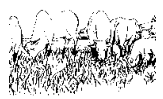
A few healthy, well-fed cows produce more milk than a lot of thin, ill animals.